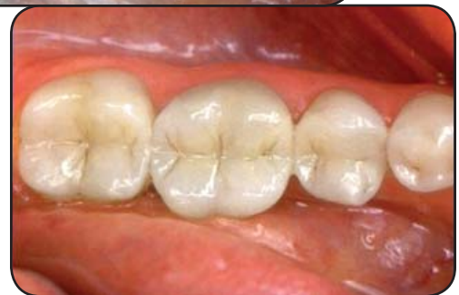
White restoration - before & after