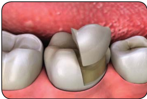
Placing an indirect restoration