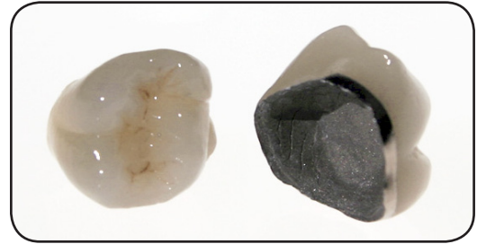
Crown showing fused metal inside the crown shell