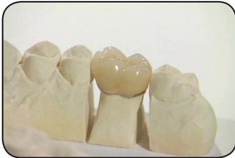
Trying crown on model