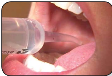
Rinsing with a medicated solution

After your tooth has been extracted, we'll give you complete instructions about caring for your mouth. Following them exactly will help you avoid dry socket. It's especially important to avoid certain behaviors that can cause the premature loss of a blood clot, particularly within the first 24 hours after an extraction.