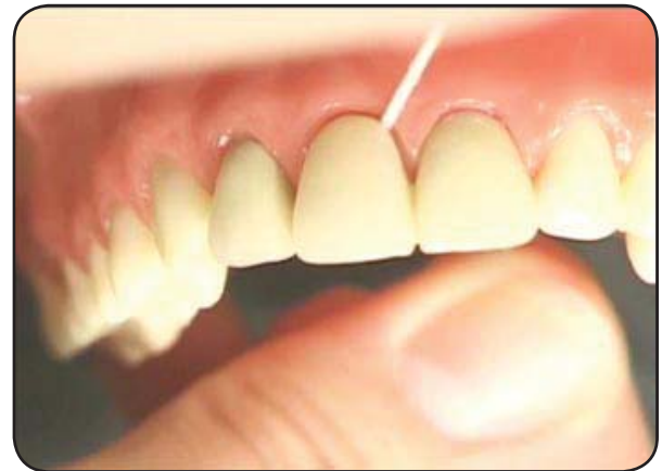
Superflossing a bridge