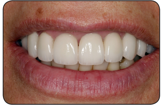
Porcelain crowns are natural looking