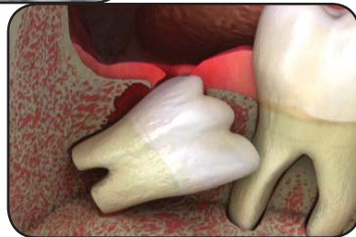
Impacted wisdom tooth with cyst developing under the gumline