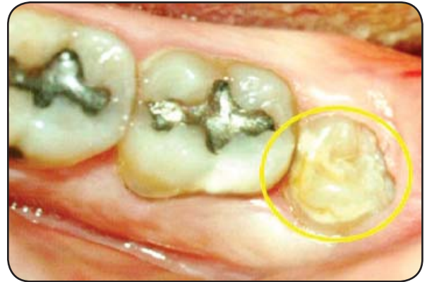
Partially-erupted wisdom tooth