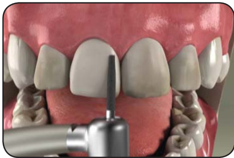
Preparing the teeth

Veneers can give you straighter, whiter, and more even-looking teeth. The porcelain has a translucent quality that resembles your natural teeth.