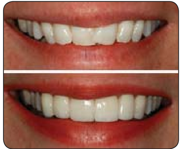
Before & after veneers