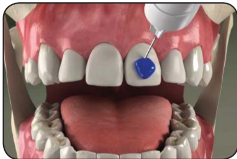
Applying the bonding agent